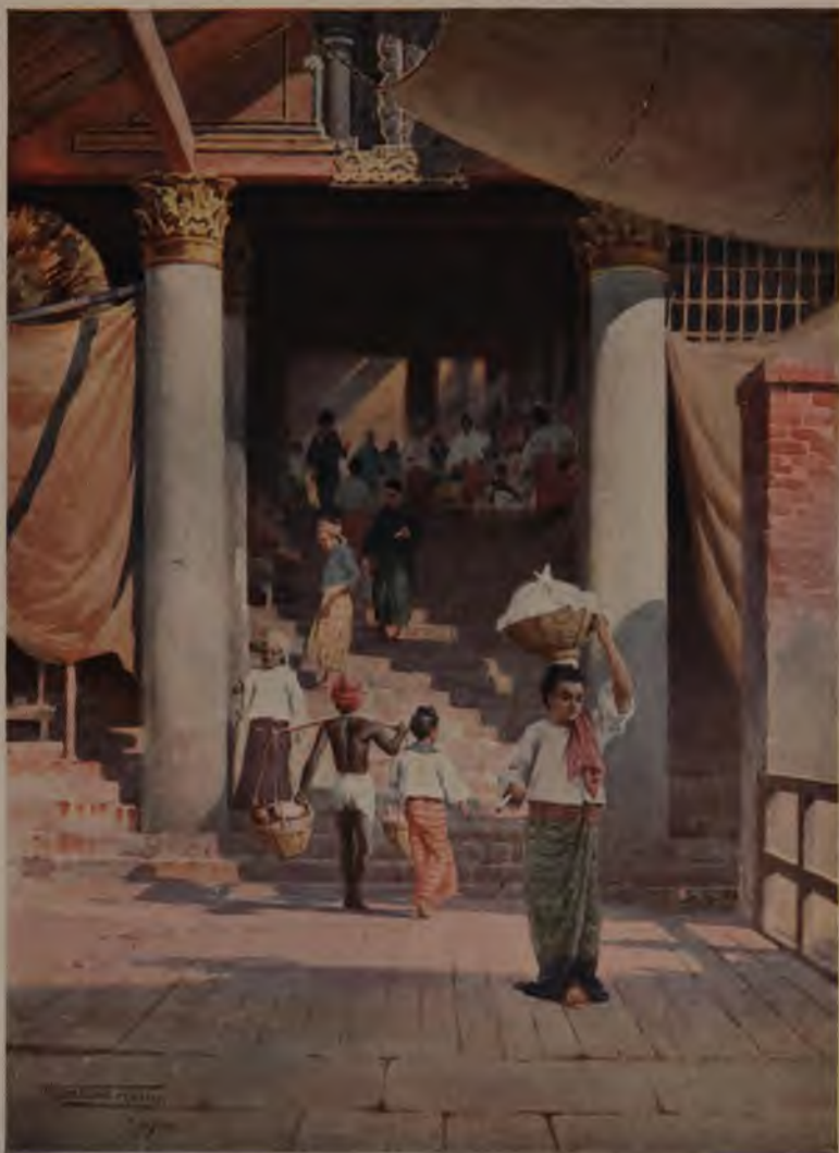
THE PAGODA STEPS, RANGOON. Page 16.